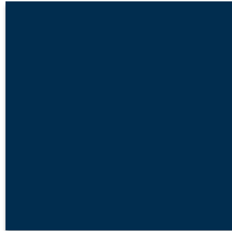
Trinidad State Navy

The official colors for Trinidad State are navy and gold. The exact CMYK combinations and Pantone or PMS codes are listed below. Color variations are to be expected based on different printers and colors available from vendors. However, when options are limited, you should find the closest color match to official navy and gold school colors. For assistance, contact the Marketing Department.