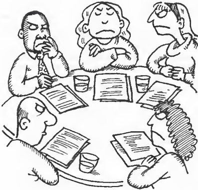
reaching a consensus