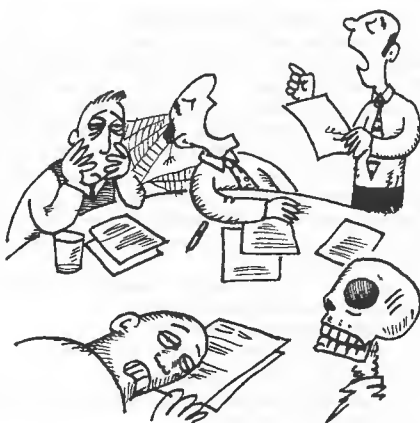
debating at length

If you don't spend much time on an issue, you touch on the issue . If you pay a lot of attention to an issue you: