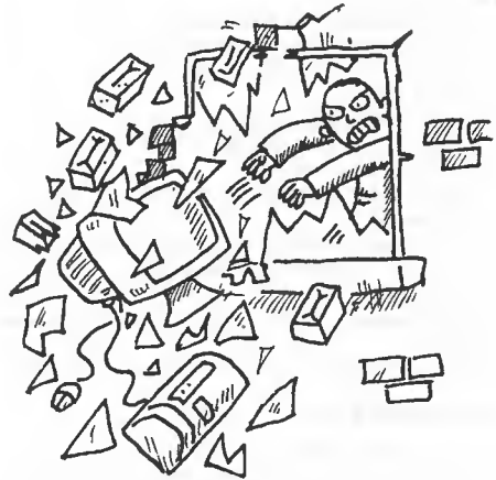
resizing a window