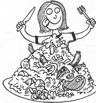
a substantial meal