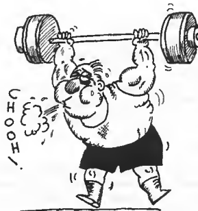
a heavy cold